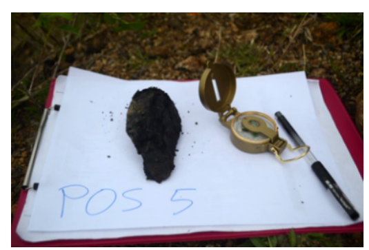
Figure 6. Sample 5, Coal

• Sample 5 in Pos 5 is young coal. This coal is young because it's taken from the outer side. While the old coal is at the very bottom, and it is possible that in the future it can be turned into mining material. Coal has a fresh color in black and weathered color in blackish brown. Coal is formed by organic sedimentation processes in swamps, lakes and shallow seas in the past. The rock position is at 119°42′5.1″E and 4°30′15.6″S at 142 masl.