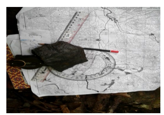
Figure 9. Sample 8, Greenschist

• Sample 8 in Pos 8 is greenschist which is a metamorphic rock. The vegetation is in the forest, with a sloping topography. This greenschist has a weathered color in brown with a fresh color in dark gray. The position of this stone is 119°42'19.27"E and 4°28'32.72"S which contains mica minerals and is anhedral in shape.