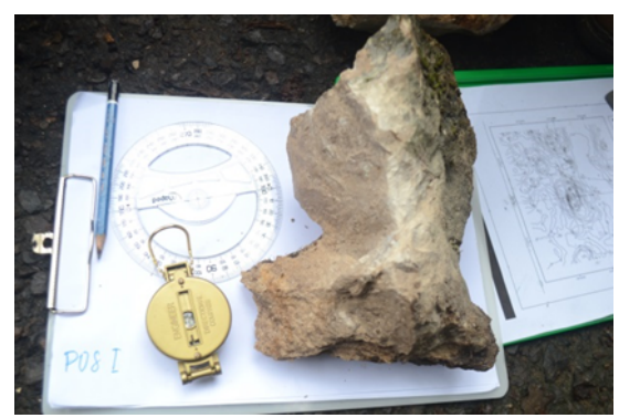
Figure 2. Sample 1, Limestone Quartz

• Sample 2 in pos 2 is limestone sand, with steep topography and lots of tree and moss vegetation. This pos 2 is rather muddy with a rather clay soil. Limestone sand has a weathered golden brown color and for the fresh color is gray. This rock was formed due to mechanical sedimentation in the shallow seas from the past, limestone sand was found at position 119°42'9.1"E and 4°29'5.8"S.