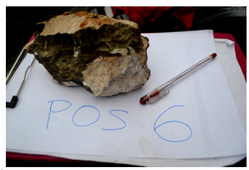
Figure 7. Sample 6, Limestone Bioturbation

• Sample 7 in Pos 7 is breccia, which was found in the river area. The position of these rocks is 119°42'27.5"E and 4°30'23.9"S.