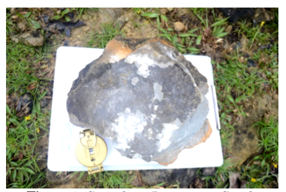
Figure 3. Sample 2, Limestone Sand

• Sample 2 in pos 2 is limestone sand, with steep topography and lots of tree and moss vegetation. This pos 2 is rather muddy with a rather clay soil. Limestone sand has a weathered golden brown color and for the fresh color is gray. This rock was formed due to mechanical sedimentation in the shallow seas from the past, limestone sand was found at position 119°42'9.1"E and 4°29'5.8"S.