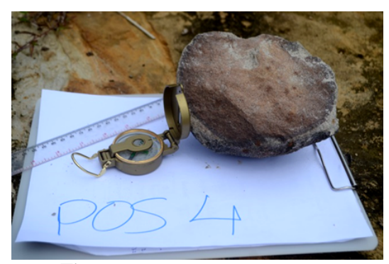
Figure 5. Sample 4, Sandstone

because it indicates that in this rock the oxidation process occurs so that the color changes. The vegetation is grass with the sloping topography. The position of this rock is 119°42′13.4″E and 4°30′10.7″S.