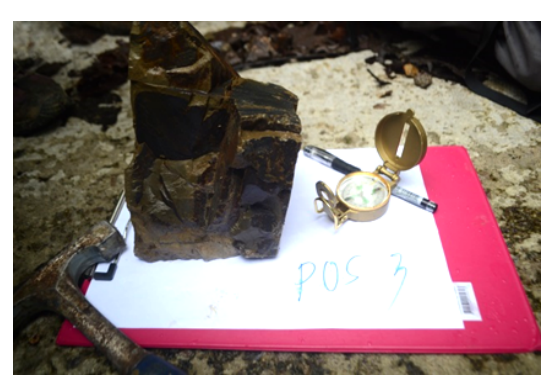
Figure 4. Sample 3, Shale

• Sample 3 in Pos 3 is a shale with its discovery position on the edge of a cliff. This shale rock is formed from the process of mechanical sedimentation in the deep sea because it appears in its clastic texture. Shale have a fresh color in black-purple and the weathered color is dark gray. Located in 119°42'7"E and 4°29'13.2"S with 127 masl, the vegetation is teak woods and steep topography.