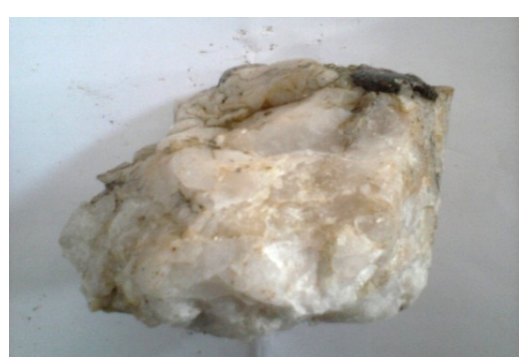
Figure 10. Sample 9, Quartzite

• Sample 10 in Pos 9 is a chert. This rock is located on the river bank or this sample is classified as secondary sources as described in (Crandell, 2005). The chert itself has a brick red fresh color and maroon in weathered color which is formed from the process of organic and chemical sedimentation in shallow seas. The position of this rock is 119°42'11.43"E and 4°28'16.94"S.