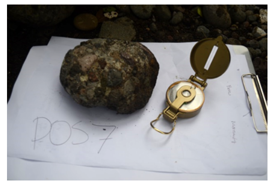
Figure 8. Sample 7, Breccia

• Sample 7 in Pos 7 is breccia, which was found in the river area. The position of these rocks is 119°42'27.5"E and 4°30'23.9"S.